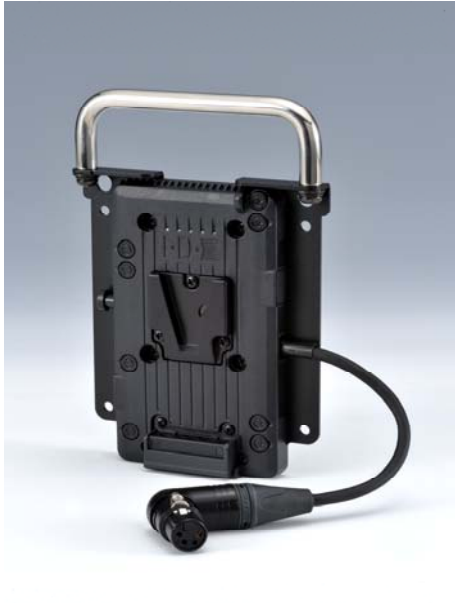
A-E2LCD-2 with rugged handle & hardwire connector

The A-E2LCD-2 battery adaptor can be mounted on all VESA 100 compliant LCD monitors.